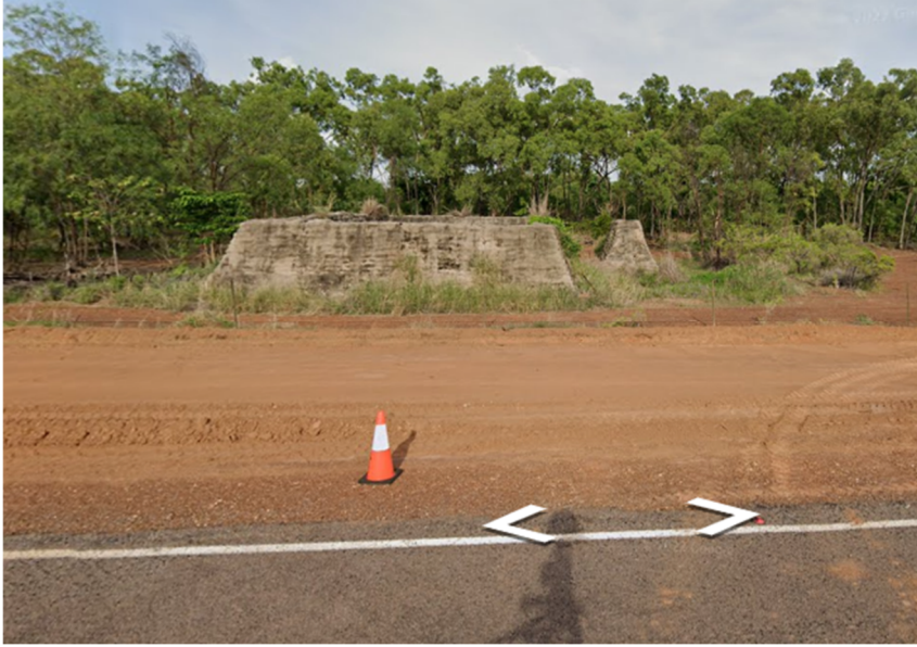
Figure 7-2 'The Bunkers'