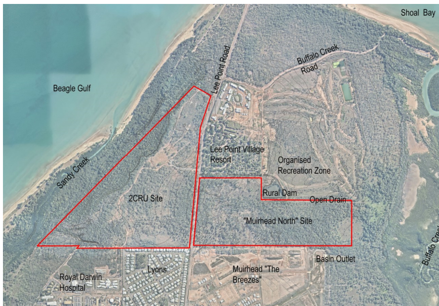
Figure 1-1 Location plan

The site location and proposed staging plan are depicted in Figures 1-1 and 1-2 below.